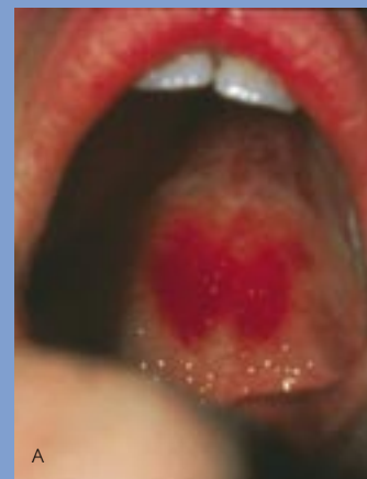
Bruising of hard or soft palate from forced oral sex