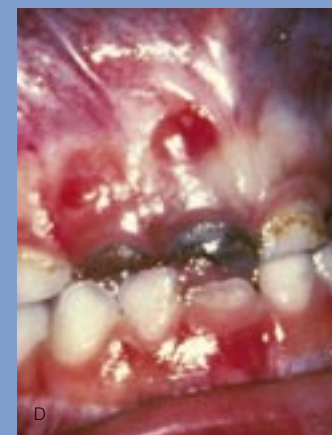
Repeated trauma to the mouth may be confused with Early Childhood Caries