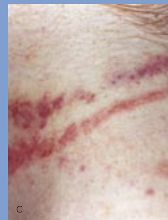
Injuries from attempted strangulation may include a linear pattern or thumb bruising