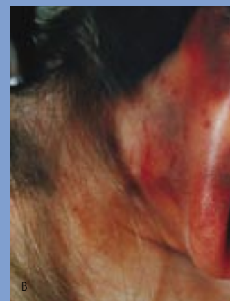
Bruises behind the ear as a result of a blow to the side of the head